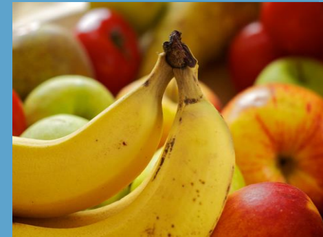
Fruit/Veg for Morning Snack.