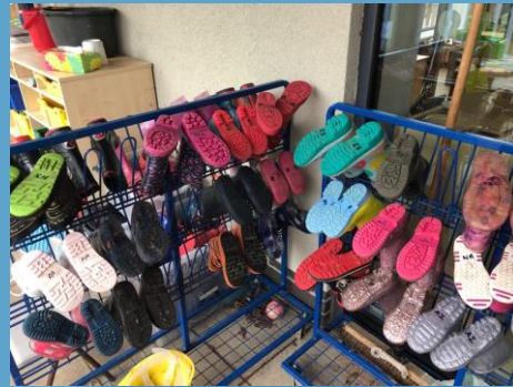
NAMED Wellie Boots