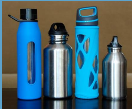
NAMED water bottle

Please send your child in with a healthy packed lunch if they will be staying with us over lunch time, we do have a hot lunch option at a additional cost – please ask for more details.